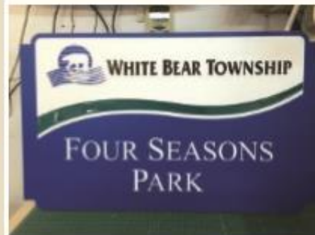
Flat routed blue / white / blue HDPE with teal and black epoxy color fills.