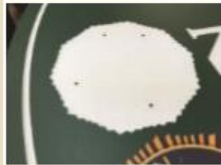
Flat routed green / white / green HDPE with full color detailed VFW logo achieved with TUFF panel logo insert. A "pocket" is flat routed to accept logo panel. The logo panel is fastened with tamper resistant screws and threaded inserts.