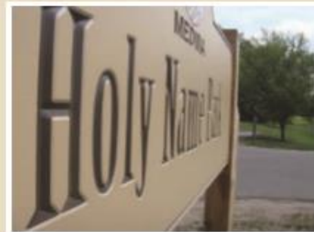
Tan / brown / tan with carved V-groove letters

vackersign.com | (877) 487-3101 | (651) 487-3100